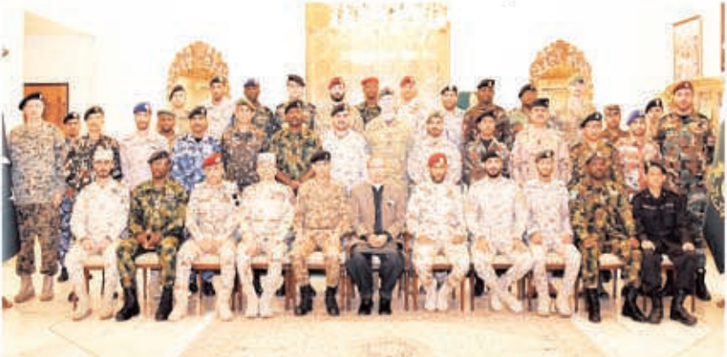
ISLAMABAD: President Dr. Arif Alvi in a group photo with the foreign military officers currently undergoing training at Command and Staff College, Quetta, at Aiwan-e-Sadr.

Tractors is the most overvalued business. Profitability The net profit margin and gross profit margin of Al-Ghazi Tractors Limited serve as indicators of its profitability. Both the profits kept fluctuating from 2018 to 2021, but remained in the positive territory. Al-Ghazi Tractors Limited was incorporated in Pakistan under the Companies Act, 1913 (now Companies Act, 2017) as a public limited company in June 1983. The company is principally engaged in manufacture and sale of agricultural tractors, generators, implements, and spare parts. It also provides irrigation solutions. The company is a subsidiary of Al-Futtaim Industries Company LLC, UAE. Despite growing import costs resulting from higher global commodity prices and less favourable local currency exchange rate, the gross profit of the company increased 31% to Rs4 billion in 9MCY22 from Rs3 billion in 9MCY21. The profit-before taxation during 9MCY22 increased to Rs3.8 billion from Rs3.1 billion in 9MCY21, showing a growth. INP