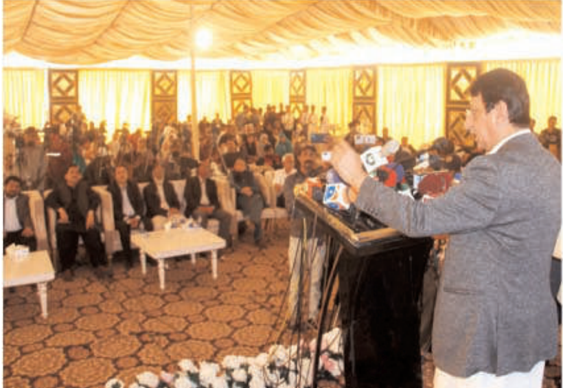
HYDERABAD: Federal Minister for IT and Telecom Syed Aminul Haque addressing during the inauguration ceremony of New Digital School, construction and organized by Telecom Foundation at Latifabad.

EVs, small vehicles like rickshaws and motorcycles, if replaced with electricity driven vehicles, will surely benefit the lower-income segments of society. Pakistan's fuel import bill can be reduced if fuel-based vehicles are converted to electricity charged vehicles, and charged through solar panels. A senior official from the Ministry of Industries and Production told WealthPK that foreign car manufacturing companies regularly increase prices. The import of car parts is causing increase in import bill. INP