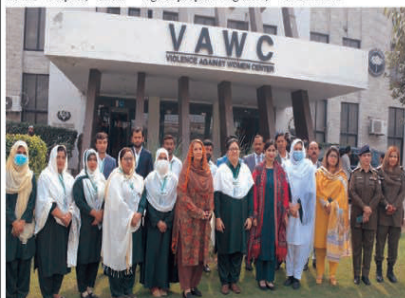
MULTAN: First Lady in a group photo with the administration and staff of the Violence Against Women Centre (VAWC) in Social Welfare Complex, Multan.

Tri-Pack Films Ltd and Sitara Chemical Industries Limited have market capitalisation of Rs5 billion each. Pakistan Synthetics Limited and Nimir Industrial Chemicals Limited have the largest market cap of Rs6.3 billion each.