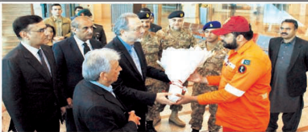
ISLAMABAD: Rana Tanveer Hussain Federal Minister for Education and Professional Training and Türkiye Ambassador in Pakistan Mehmet Paçacı received Turkiye-return Pakistan Army USAR team at Islamabad international Airport.

permanent peace in the South Asian region and India must be clearly told to fulfill its pledges made before the UN to settle the Kashmir dispute.