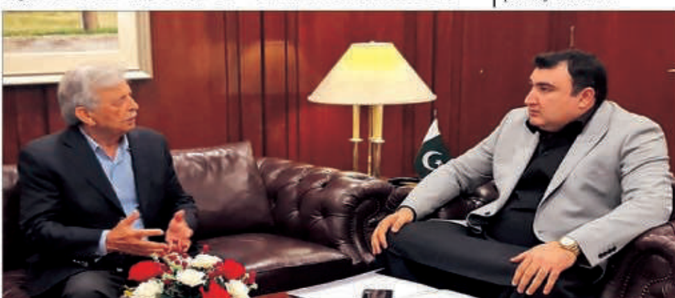
ISLAMABAD: Minister for Federal Education and Professional Training, Rana Tanveer Hussain called on Deputy Speaker National Assembly Zahid Akram Durrani.