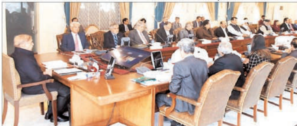
ISLAMABAD: Prime Minister Muhammad Shehbaz Sharif chairs a meeting of Federal.