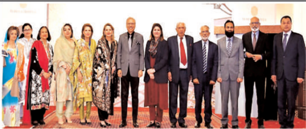
ISLAMABAD: President Dr. Arif Alvi and First Lady Begum Samina Arif Alvi in a group photo with the Board of Governors of Behbud Maternal and Children Hospital Rawalpindi.