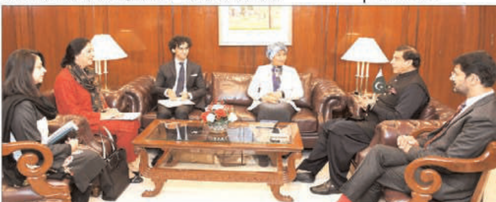
ISLAMABAD: Speaker National Assembly Raja Pervaiz Ashraf in a meeting with UN Women delegation led by Country Representative Sharmeela Rasool at Parliament House.

The assistance responds to the Government of Pakistan's request to support its post-flood recovery and reconstruction efforts and is aimed at supporting the restoration of irrigation, drainage, flood risk management, and on-farm water management, and transport infrastructure in the flood-hit provinces of Balochistan. INP