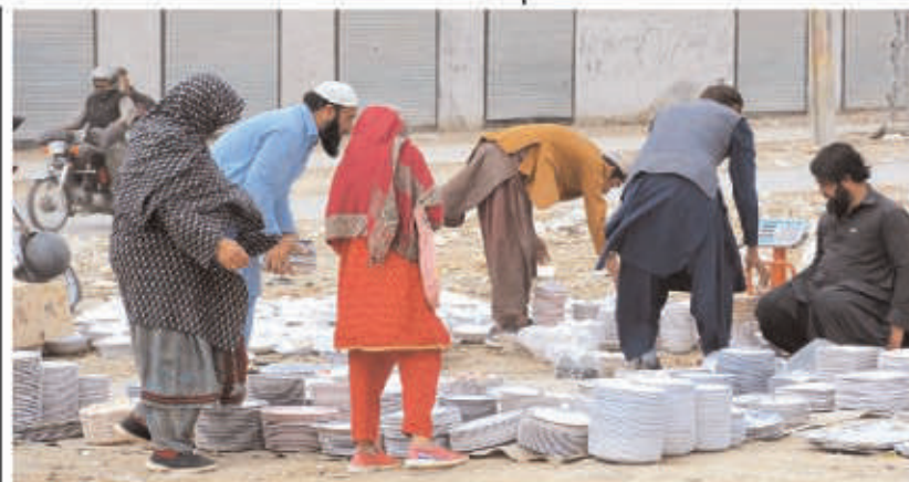
QUETTA: People buying and purchasing crockery along roadside vendor stall.

In a key development, the SBP decided to convene an emergency meeting of the Monetary Policy Committee (MPC) on Thursday, March 2, to deal with emerging risks to the economy. INP