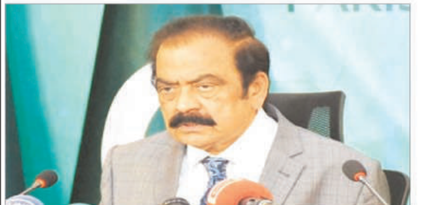
ISLAMABAD: Federal Minister for Interior Rana Sanaullah addressing a press conference.

The official said the PWD had started sending notices to the allottees of government accommodation in Sector I-9/4 about payment of electric meter bills for water motors installed at residential blocks. He said the Finance Division had allocated funds for payment of utilities in the relevant heads of accounts of the users while utility bills of the residential accommodation, including hostels. INP