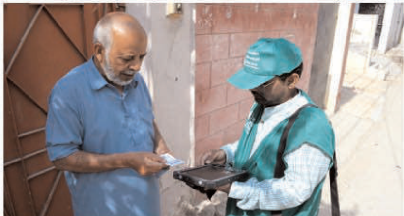
HYDERABAD: Workers of Pakistan Bureau of Statistics going door to door to collect data during Digital Census in Hyderabad.

The PAC chairman also directed that the ban on new sites of petrol pumps in Balochistan, Khyber Pakhtunkhwa (KP), Hazara and Peshawar should be lifted.