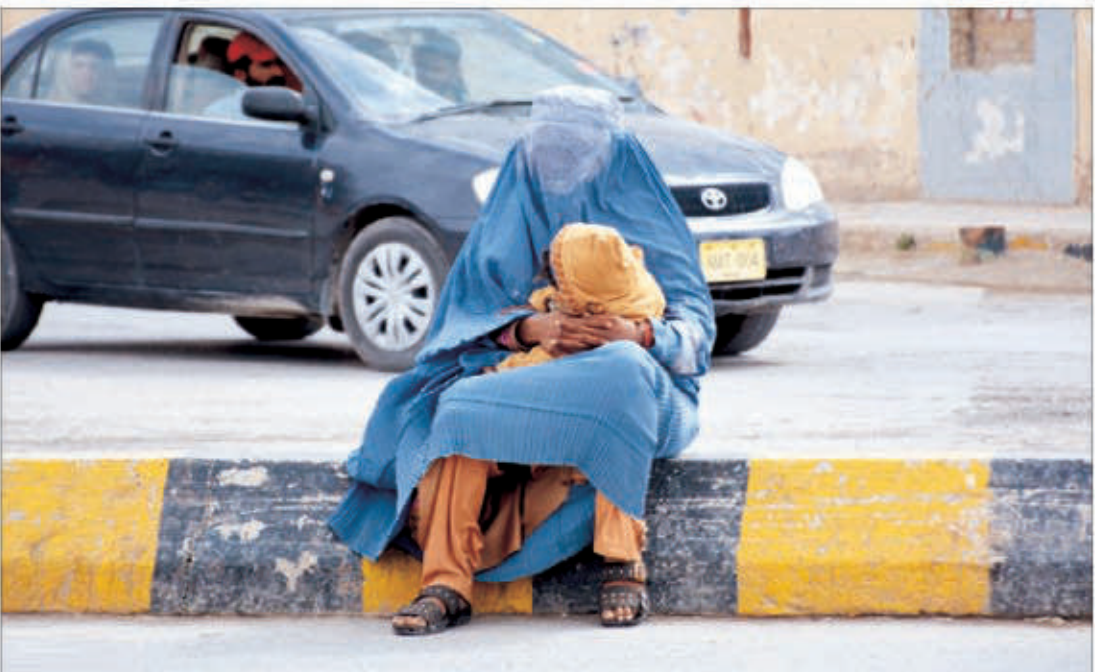
QUETTA: A bagger woman hold her baby while asking some mercy to commuters.

nity with a shared future for mankind, promote greater democracy in international relations, and make global governance more just and equitable. "The new journey of China's diplomacy will be an expedition with glories and dreams, and it will also be a long voyage through stormy seas," he said, vowing to meet challenges head-on. China will foster an enabling external environment for building a modern socialist country in all respects, and write a new chapter in China's distinctive major-country diplomacy in the new era, said the Chinese foreign minister. "China fully respects Middle Eastern countries as the masters of their own affairs. We have no intention to fill a so-called vacuum," Chinese Foreign Minister Qin Gang said. "And we will not build exclusive circles," he added. In the Middle East, China will be a facilitator for peace and stability, a cooperative partner for development and prosperity, and an enabler for building strength through unity, Qin stressed. China-Europe relations are not targeted at, dependent on, or subjected to a third party, Chinese Foreign Minister Qin Gang said. No matter how the situation develops, China always regards Europe as a comprehensive strategic partner and supports European integration, Qin said. China hopes Europe truly achieve strategic autonomy and lasting security and stability, he said. China is willing to work with Europe to uphold true multilateralism, and to deepen the comprehensive strategic partnership, he added. INP