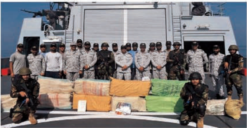
ISLAMABAD: Pakistan Navy Ship seized huge quantity of drugs during deployed on Regional Maritime Security patrol at North Arabian Sea.

Later, Fawad Chaudhry took to social media and warned that any attempt to arrest the PTI chief would further deteriorate the situation. INP