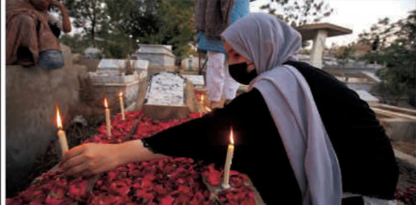
KARACHI: Women lighting candle at their love ones graves in graveyard on the occasion of Shab-e-Barat.

$15 Million in international market. The vessel and crew members were later handed over to Law Enforcement Agencies for further legal proceedings. The successful anti-narcotics operation by Pakistan Navy Ship reaffirms PN resolve to deny illegal activities in maritime zones of Pakistan. Pakistan Navy Ship while undertaking maritime security operations intercepted a suspicious stateless fishing boat at sea. Upon search of the boat, Pakistan Navy troops seized 280 Kg narcotics (Crystal and Ice) worth approximately US $15 Million in international market. The vessel and crew members were later handed over to Law Enforcement Agencies for further legal proceedings. The successful anti-narcotics operation by Pakistan Navy Ship reaffirms PN resolve to deny illegal activities in maritime zones of Pakistan. PR