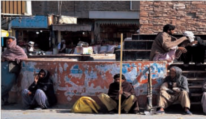
QUETTA: Daily wages labour sitting with their work tools along roadside while waiting for customers.

awarded with 'Pride of Performance' and 'Sitara-e-Imtiaz' awards for his outstanding performances. He was also nominated for 'Nishan-e-Pakistan' award this year and also received 'Life Time Achievement Award' in tribute to his work for Radio Pakistan and Pakistan Television. Some of his masterpieces included 'Lakhon mein teen', 'alif noon', 'andhera ujala', 'angar wadi' and 'ashiana' among TV serials and also played roles in movies like 'tiger gang' and 'sarfarosh'. He had passed away yesterday at the age of 80 years. Renowned actor was a cancer patient and had traveled to Canada to his family for his treatment. INP