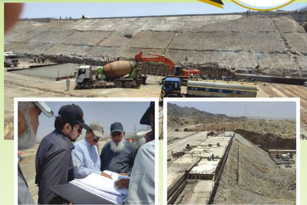
Mir Muhammad Khan Lehri Minister Irrigation Balochistan

The development objective of the project is to improve the management of water resources among targeted communities and farmers and selected rivers basins of Balochistan. The federal and provincial governments have launched various projects to improve the water table in Balochistan. Officers and staff of the Irrigation Department are making hectic efforts to ensure timely and quality completion of these projects. The completion of Windar dam projects would bring a major change in the province. This would maintain the depleting water table to a large extent. The present government's priority is to maintain the water table and address the issue of water scarcity.