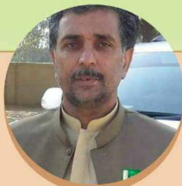
Mir Abdul Quddus Bizenjo Chief Minister Balochistan

The development objective of the project is to improve the management of water resources among targeted communities and farmers and selected rivers basins of Balochistan. The federal and provincial governments have launched various projects to improve the water table in Balochistan. Officers and staff of the Irrigation Department are making hectic efforts to ensure timely and quality completion of these projects. The completion of Windar dam projects would bring a major change in the province. This would maintain the depleting water table to a large extent. The present government's priority is to maintain the water table and address the issue of water scarcity.