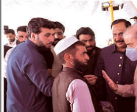
RAWALPINDI: Prime Minister Muhammad Shehbaz Sharif visits Free Atta distribution points established under PM's Ramadan Package for deserving families.

(LHC) after which they arrived at the judicial complex but they weren't allowed to move further. "More FIRs against Imran Khan were lodged that day," he added. At this, IHC CJ asked the lawyer to clarify why they bypassed a forum to reach IHC. Imran Khan's lawyer said attacks on two former prime ministers have taken place, my client has also serious lengthy threats to add. To this, CJ IHC remarked that the government has done wrong. IHP