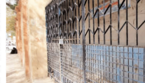
Saitani Welfare Water Filtration Plant said.

The Balochistan government had announced to the restoration of all 802 water filtration plants to provide clean drinking water to the masses. However, the Public Health Engineering Department (PHED) is yet to make the out-of-order plants functional.