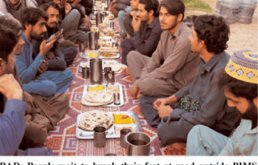
ISLAMABAD: People wait to break their fast at road outside PIMS hospital on the Holy Month of Ramadan in Federal Capital.

RAWALPINDI: Anti-Narcotics Force (ANF) recovered over 74 kg drugs while conducting seven operations across the country and arrested five accused, said an ANF Headquarters spokesman here on Monday. He informed that ANF conducted an operation at Islamabad International Airport recovered over two kg of drugs from the possession of a Qatar-bound passenger, resident of Swabi. In another operation, 131 hero-in-film capsules were recovered from the possession of a Dubai-bound passenger, resident of Khyber Agency netted at Islamabad International Airport. In third operation at Lahore International Airport, 30 hero-in-film capsules were recovered from the possession of a Bangkok-bound passenger, resident of Pakpattan. The spokesman informed that ANF in an operation in Faisalabad managed to recover 4.8 kg opium and rounded up two accused, residents of Faisalabad. ANF and FC in two different operations in Khyber recovered 43 kg khat. He informed that ANF foiled a bid to smuggle drugs from Afghanistan to Balochistan and recovered 25 kg crystal heroin from Chaghi area. Separate cases have been registered against the accused while further investigation is underway, he said. IHP