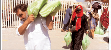
LAHORE: A large number of people stand in a queue to collect free wheat flour bags from Ramadan Package at Egerston Road, in Provincial Capital.

LAHORE: The Board of Intermediate and Secondary Education (BISE) Lahore has released the schedule for the Class IX session 2023 to 2025. The board registration fee for the 9th class has been fixed at Rs1000 for the session 2023-25. The Lahore Board has also fixed the processing fee for admission of students at Rs30. As per the announcement of the BISE Lahore, registration for the class 9th could be submitted from April 01, 2023, to April 30, 2023. And, from May 16 to May 30, admission will be charged with a late fee of Rs600. The Lahore Board will also charge a fine of Rs 600 per day to the students who will deposit the registration fee after the scheduled date. The board registration fee for the 9th class has been fixed at Rs1000 for the session 2023-25. The Lahore Board has also fixed the processing fee for admission of students at Rs530. As per the announcement of the BISE Lahore, registration for the class 9th could be submitted from April 01, 2023, to May 15, 2023 INP.