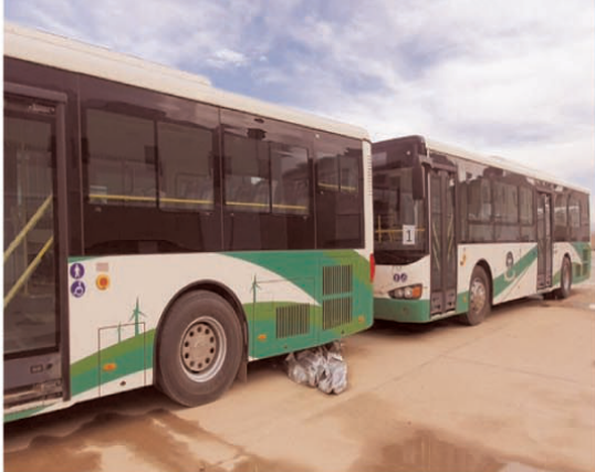
Balochistan Transport department purchased 8 buses initially to operate them to Bellili and Sariab in the first phase