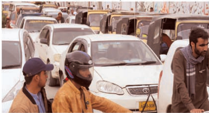
QUETTA: A view of traffic struck during iftar time in provincial capital.

The continued increase in the price of necessities proves the weakness or collusion of the administration, he observed. INP