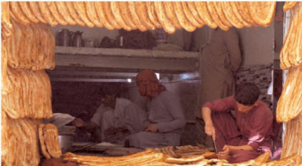
QUETTA: A worker busy in baking bread in a traditional oven (tandoor) for customers.