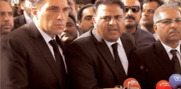
ISLAMABAD: Senior leader of PTI Fawad Chaudhry along with lawyer of PTI Ali Zafar and others talking with media outside the Supreme Court.

PTI leaders Yasmeen Rashid, Mian Aslam, Asad Umar, Farrukh Habib and others were booked by Shahdadm police in Lahore over vandalism charges. Yasmeen Rashid, Mian Aslam and other PTI leaders appeared before the court, while Farrukh Habib did not show up. ATC while extending the interim bail of Yasmeen Rashid, Mian Aslam and others rejected Farrukh Habib's plea over his continuous absence in court hearings. I.N.P.