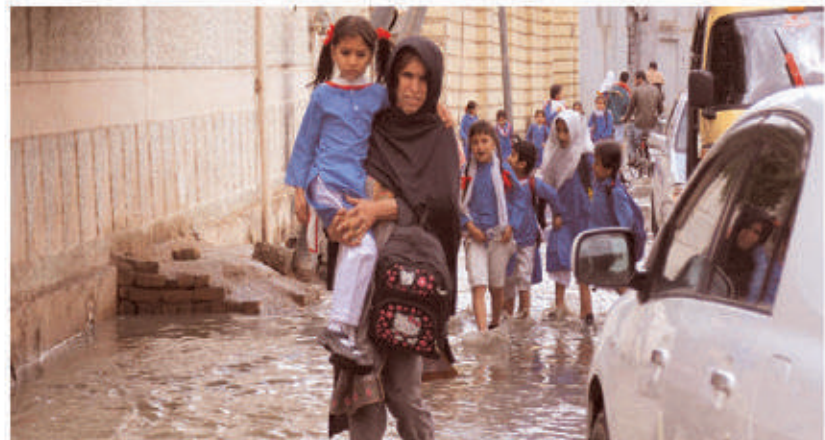
QUETTA: School children passing through accumulated rain water after rain in provincial capital.

ISLAMABAD: As many as 50 persons tested positive due to coronavirus during the last 24 hours in the country.