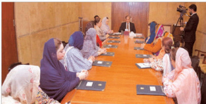
ISLAMABAD: A delegation of women parliamentarians of PML (N) calls on Prime Minister Muhammad Shehbaz Sharif.

Many important decisions were also taken as a result of suggestions and recommendations of the heads of federal departments in the meeting. INP