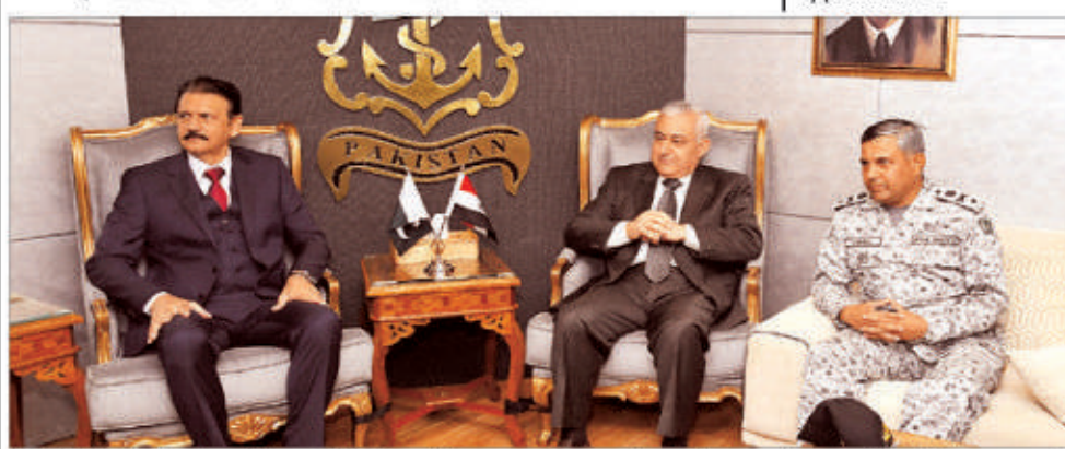
SYRIA: Pakistan Navy Mission Commander exchanging views with Governor of Lattakia, Syrian onboard PNS MOAWIN upon arrival at port Lattakia, Syria during international Humanitarian Assistance and Disaster Relief (HADRR).

Various projects under CPEC are being executed to resolve the water issue. A 1.2 MGD seawater desalination plant is near its completion. The plant is a grant from the Government of China for the people of Gwadar. INP