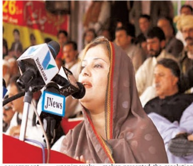
government unanimously adopted the resolution calling for a 33 percent quota of women in services.

The chair put the resolution for voting. All the lawmakers from the opposition and the