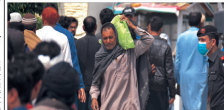
ISLAMABAD: A man leaves on the way after collecting free bags of flour from a government distribution point E-11.

Earlier, the larger bench of IHC sought a response from the government and Insaf chairman Imran Khan in the case INP.