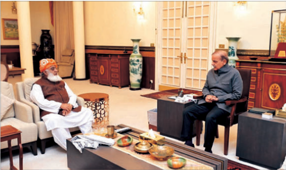
ISLAMABAD: President Jamiat Ulama-e-Islam (F) Maulana Fazal ur Rehman calls on Prime Minister Muhammad Shehbaz Sharif in Federal Capital.

They include administrative restrictions on imports; revisions in prudential regulations for auto and consumer financing; linking of mark-up rate on the SBP's refinancing schemes (EFS and LTF) with the policy rate; and increase in the cash reserve requirement (CRR) for banks to 6 per cent from 5 per cent INP.