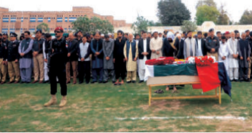
PESHAWAR, PAKISTAN, MARCH: Relatives and security officials gather around the coffins of policemen who were killed by a roadside bomb in Lakki Marwat district of Khyber Pakhtunkhwa province.

The accused was the resident of Talagang. In yet another operation, an attempt to smuggle 280 grams of heroin to England through a private courier office at Lahore International Airport was foiled by ANF officials. Officials said that the recovered heroin was hidden in different types of plastic sheets and plastic packets. Moreover, the ANF team conducted a raid at a local court assembly hall at MM Jinnah Road Karachi and recovered 4 kg and 160 grams of ice, absorbed into a cover, from a parcel coming from Rawalpindi. Two Karachi residents were arrested. Both the accused were also wanted by ANF in several cases. Cases have been registered against the arrested accused under the Anti-Narcotics Act. INP.