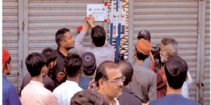
HYDERABAD: Assistant commissioner city and his team surprising visit of markets and seal the shops due to over charging and dumping sugar.

Moreover, the company's net profit decreased significantly by 45% from Rs136.67 million in 6MFY22 to Rs75.6 million in 6MFY23, which is a cause of concern for the company and its stakeholders.