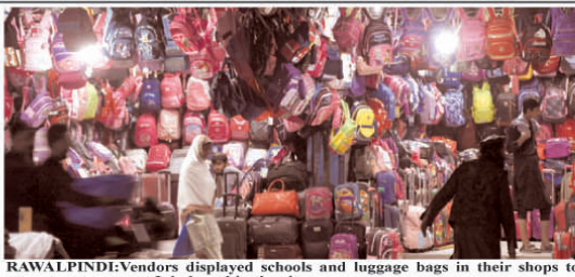
RAWALPINDI: Vendors displayed schools and luggage bags in their shops to attract costumers at Iqbal road in the city.

However, the company's profit-before-tax decreased by 3% from Rs166.7 million in FY22 to Rs157.1 million in FY23, which indicates the company incurred higher expenses or faced other financial challenges during the period.