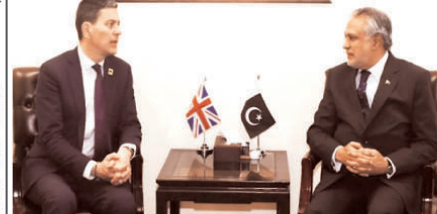
ISLAMABAD: David Miliband, President and CEO of International Rescue Committee, called on Federal Minister for Finance and Revenue Senator Mohammad Ishaq Dar at Finance Division.

ISLAMABAD: The Pakistan Bar Council (PBC) has lauded Supreme Court justice Gazi Faez Isa's participation in the golden jubilee ceremony of the 1973 Constitution held in the Parliament House last week. The participation of Justice Isa showed that the Supreme Court judges are the guardians of the Constitution, the lawyers' constitutional body said in a press release. The bar council recalled that former chief justice Anwar Zaheer Jamali had also attended a Senate convention. The bar council praised Justice Isa's commitment and support for the Constitution, and rejected as "unwarranted" the criticism that he should not have attended the convention. It said the PBC has become active in order to end the constitutional and political crises in the country. In view of the tension between the state institutions, the council has called a representative meeting of lawyers' organizations across the country at 11:30 am on April 17. The meeting, which will be held at the PBC office, will mull over a strategy to defuse the prevailing political tension. The council said the country cannot afford the troublesome situation. INP