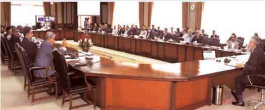
ISLAMABAD: Federal Minister for Finance and Revenue Senator Mohammad Ishaq Dar presided over the meeting of the Economic Coordination Committee (ECC) of the Cabinet.