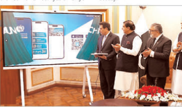
ISLAMABAD: Speaker National Assembly Farveez Ashraf launching the Constitution APP in connection with Golden Jubilee Celebration of Constitution of Islamic Republic of Pakistan.