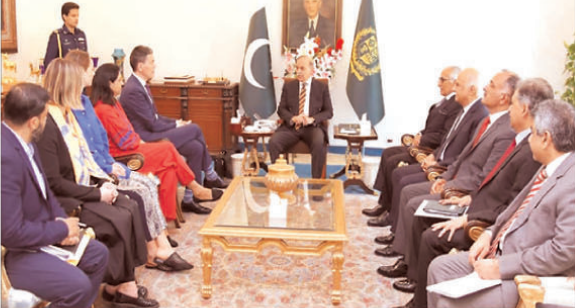
ISLAMABAD: David Miliband, President and CEO of the International Rescue Committee calls on Prime Minister Muhammad Shehbaz Sharif.