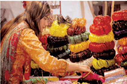
ISLAMABAD: A girl is buying bangles from stall at Jinnah Super Market as the preparation of Muslims grand event Eid-ul-Fitr in super market with great zeal across the country.

in its constitutional domain. The bill, titled the Supreme Court (Practice and Procedure) Bill 2023, was passed by both houses of parliament and sent to the president for his assent. However, the president had sent it back, saying it was against the history of Pakistan and the SC. The coalition partners vowed to resist till the bill is taken away parliament's authority and to interfere