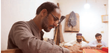
QUETTA: Worker busy in embroidery on customer cloth on ahead of Eid-ul-fitr.

KHANEWAL: The local district administration has decided to take strict measures to eradicate the suspected presence of dengue larvae after recent rains. In this regard, 400 teams of the health department have been formed for dengue surveillance, said Deputy Commissioner Wasim Hamid in a meeting. The DC directed the authorities concerned to pay special attention to city service stations, tire shops and the central graveyard to conduct research and distribute pamphlets among citizens to make them aware of the hazards. INP