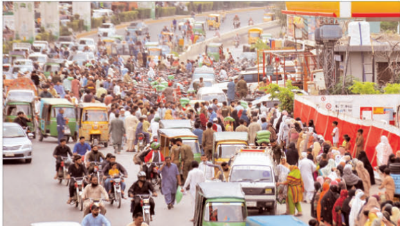
RAWALPINDI: A view of the traffic jam at Murree road due to the crowd of deserving people for taking free flour at distribution point in sports complex as 25th Ramadan (Today) is the Last day of free Flour scheme across the Punjab.

The spokesperson said that the Katcha criminals are retreating to an island type riverine area in a jungle after the police destroyed several holed-up hideouts of militant hideouts. On the other hand, a police operation in the Ghalpura area of Kashmir area against the criminal elements is also underway. Several armored personnel carriers (APCs) of police have reached the area. Police have entered the houses of dacoits who have fled to Katcha area of Raza, Sindh. However, an exchange of fire from both sides is going on. On Saturday, dacoits attacked a police party in Kashmir bordering Ghotki and martyred two policemen and injured four others including an SHO. The bandits and dacoits, who have long found refuge in the massive riverine area along the banks of the Indus with its inaccessible terrain, are now showing signs of retreat. The Federal cabinet on Saturday gave its assent for the deployment of Army troops in the ongoing anti-bandit operation in the Punjab riverine (katcha) area. The Punjab police launched a 'granite operation' against robbers and kidnappers in the katcha area of the Indus near the Sindh border on April 10. INP