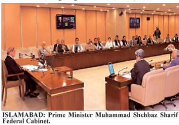
ISLAMABAD: Prime Minister Muhammad Shehbaz Sharif chairs a meeting of the Federal Cabinet.