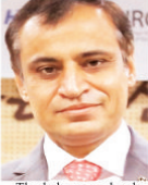
The beleaguered public offices have come under a new wave of shovels associated with broadening the turf war. The new rallying point is to assert the right for the coveted packages in wages given to the provincial secretariat. Guided by the tools provided by the attached department, the number of associations has multiplied and the pre-existing ones have coalesced into a broader alliance.

In this blame game between doctors and the minister, the common man is the worst sufferer. The provincial government in general and the health department in particular should make the machines functional since it is their core responsibility.