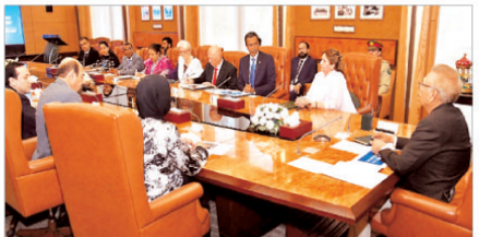
ISLAMABAD: President Dr. Arif Alvi being briefed about the initiatives of UNICEF in Pakistan's health and education sectors, at Awan-e-Sadr.