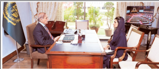
ISLAMABAD: Minister of State for Foreign Affairs Hina Rabhani Khar calls on Prime Minister Muhammad Shehbaz Sharif in Federal Capital.