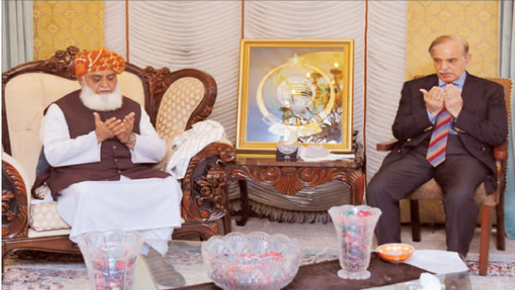
ISLAMABAD: Prime Minister Muhammad Shehbaz Sharif offer condolences on the death of Federal Minister for Religious Affairs Mufti Abdul Shakour during his visits the residence of President Jamiat e Ulama e Islam, Maulana Fazal-ur-Rehman.

Last year, India suffered coal shortages, the main source of electricity in the nation of 1.4 billion people, as electricity demand peaked in the heat. Many parts of India rely on trains to supply water during the summer. Scientists also believe the annual monsoon rainy season is becoming more erratic and powerful, causing greater flooding. Around 20 people were hospitalised and 300 fell ill at the event near the western city of Mumbai on Sunday, when temperatures hit close to 38 degrees Celsius (100 Fahrenheit) with high levels of humidity, local media reported. Senior government officials attended the ceremony, including Interior Minister Amit Shah, who praised the crowd for waiting so long in the sun. The office of Maharashtra state Chief Minister Eknath Shinde described it as a "sad and disturbing incident" and promised compensation for the victims' relatives. India's ruling Bharatiya Janata Party said around a million people attended the event, the Indian Express newspaper reported. The opposition Congress party accused the government of negligence and said it should face criminal charges. Heatwaves have killed more than 6,500 people in India since 2010, and last year saw record temperatures in several cities across the country. The hot spells are becoming harsher and more frequent across South Asia, spurred by climate change, according to scientists.