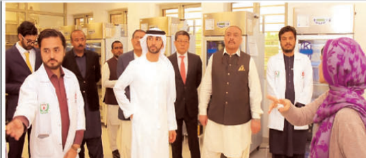
ISLAMABAD: Federal Minister of national health services Abdulqadir Patel visiting regional blood centre Islamabad along with high level delegation of UAE.

who are treated by experienced and skilled Paediatric Ophthalmologists. On average 22 to 25 paediatric eye surgeries are performed daily. A large number of patients has resulted in a high number of referrals to the trust's hospital from all over the country. A large number of cases of paediatric glaucoma are secondary causes either due to trauma, previous eye surgery, associated eye anomalies or in judicious use of steroids. Dr Sumaira highlighted that I