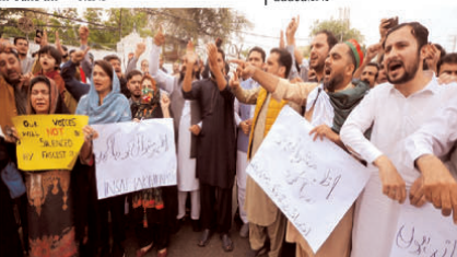
PESHAWAR: Trehek-e-Insaf workers are demonstrating in front of the press club.