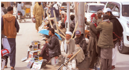
QUETTA: Daily wages labours sitting with their work tools at Bacha Khan Chowk.