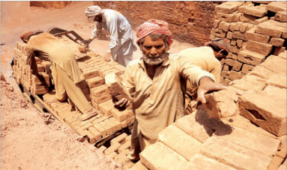
PESHAWAR: Pakistani laborers included old mans work at an phando vegetable market and brick factory ahead of International Labor Day in Peshawar.