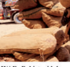
PESHAWAR: Pakistani laborers included old man work at a phando vegetable market and brick factory ahead of International Labor Day

All of the passengers and crew members underwent tests for coronavirus at the airport. In line with the directives of PAF's senior leadership, Pakistan Air Force transport aircraft are conducting air evacuation missions to bring back fellow countrymen who were stranded in war-torn Sudan. The transport fleet of the Pakistan Air Force has always been at the forefront to respond to the call of the Nation during natural disasters and calamities.