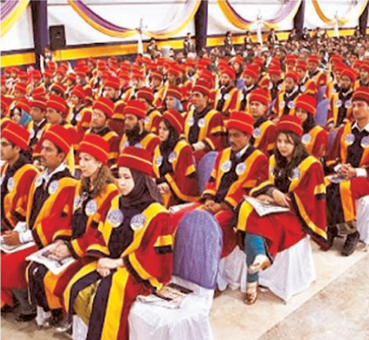
Chancellor/Governor of Balochistan

CM Bizenjo appears to be helpless before the ministers and opposition lawmakers. Although, the CM of Balochistan should not demonstrate any political rapprochement since he is the chief executive of the province. This position demands bold decisions since it is a matter of the future of thousands of youth of