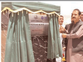
QUETTA: Federal Minister for Science and Technology Agha Hassan Baloch breaks the ground for Khuzdar Block at NUST University Quetta Campus on May 3, 2023. Rector NUST Lt. Gen. (R) Javed Mahmood Bukhari also present.

move ahead on stalled reforms sought by the IMF, promising technical help and encouraging the country to enact policies that promote an open and fair and transparent business climate. The market awaits the resumption of the International Monetary Fund (IMF) programme, which remains stalled to date. Moreover, it is also closely monitoring development at the political front, as the government and PTI leaders continued to hold talks on conflicting sections in the country.