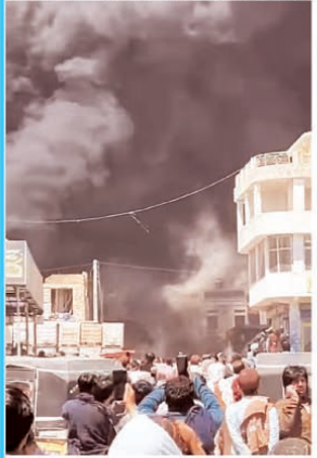
Hazar Ganji. Initial information suggests the fire broke out in the Iranian petrol and diesel

The fire damaged seven shops and damaged five vehicles parked in the Hazar Ganji area. Scores of people rushed towards the spot and extinguished the flames