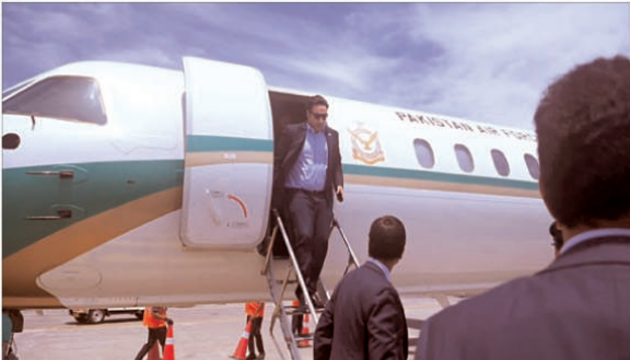
INDIA Pakistan Foreign Minister Bilawal Bhutto arrives in Goa, to attend SCO Foreign Ministers' meeting, as Bilawal Bhutto became the first Foreign Minister of Pakistan to arrive in India after a gap of nearly 12 years.

given to anyone else." PAC chairman said. "The PAC should be informed about those who have been handed over solar panels," he said. "We will welcome if panels delivered to Gwadar's fishermen, otherwise responsible persons will be made accountable," he said. The PAC demanded report from the secretary maritime affairs. The committee members also demanded physical verification of the solar panels. INP