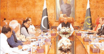
ISLAMABAD: President Dr Arif Alvi chairing a follow-up meeting on the framework for the classification of disabilities, at Awan-e-Sadr.

He said that Imran Khan was playing different types of tactics on medical grounds from a long time to get relief from courts without appearing before them and which is totally against the law and constitution, he said. INP