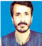
Fifty-five years ago, an incredible journey began with the creation of the Pakistan People's Party. The history of the PPP is full of struggles and sacrifices...

Students have already established libraries in the Balochistan district of Kech, Gwadar, and other areas. Daily thousands of students from various parts of the province visit libraries.