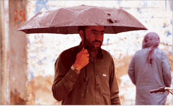
QUETTA : A man on the way hold umbrellas during rain in provincial capital.

the voters before the elections, which will further weaken the country's faltering economy and it will result in disrepute of the lender if Pakistan defaults. The business leader said that China, Saudi Arabia and the United Arab Emirates have assured loans to Pakistan. Moreover, the government was discouraging imports, resulting in a fall of 68 per cent in the current account deficit in the last eight months. He also expected to further decline in the next eight months. Import contraction was also reducing the revenue of FBR. Inflation has crossed 36 per cent, the highest level in Asia, due to which the IMF is demanding a two per cent increase in the interest rates. Mian Zahid Hussain said that economic instability is increasing rapidly due to continuous delay in payment of loan instalments by the IMF. The current agreement with the IMF was signed in 2019 and expires next month. According to the agreement, Pakistan was supposed to get a loan of $500 million as a half-yearly instalment but so far only 3.9 billion dollars have been received so far. He already accepted all IMF conditions on exchange rate, tax rate, energy price, subsidy reduction and interest rate hike but could not convince IMF to release funds. In this most difficult economic situation, if the nation unions and implements the emergency program of import substitution and privatization of failed government institutions, then this vortex can be exited, he said.