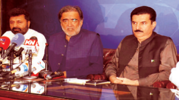
ISLAMABAD: Advisor to the Prime Minister on Kashmir Affairs and Gilgit Baltistan Qamar Zaman Kaira and Minister of State of Poverty Alleviation Faisal Karim Kundi addressing a press conference.