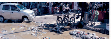
QUETTA: A view of accumulated sewerage water on double road.

SUKKUR: The Food Department and Excise Police foiled a bid to smuggle container carrying wheat bags and arrested the driver here on Monday. On a tip-off, the Food Department and Excise Police started snap checking of trailers on Rohri motorway. The police arrested the driver and impounded the container with recovered wheat which was later shifted to godown of food department. INP