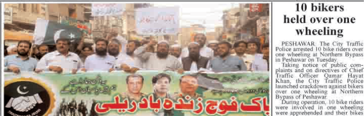
PESHAWAR: Activists of Tajran Khyber Pakhtunkhwa hold solidarity rally in favor of, Pakistan Army Zindabad at Qissa Khawani Bazaar.