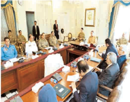
top brass, among other senior officials.

The meeting of the body, which is the highest forum for coordination on security issues, was convened under the chairmanship of Prime Minister Shehbaz Sharif at the Prime Minister's House in Islamabad. It was attended by federal ministers, Chief of Army Staff Gen Asim Munir, Joint Chiefs of Staff Committee Chairman Gen Sahir Shamshad Mirza and other