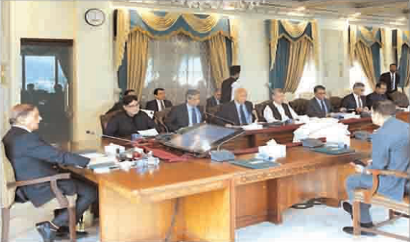
ISLAMABAD: A delegation of Commission to enquire and investigate grievances of the students of Balochistan called on Prime Minister Muhammad Shehbaz Sharif.