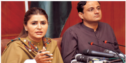
KARACHI: Shazia Marri Federal Minister for Poverty Alleviation & Social Safety and Chairperson Benazir Income Support Program addressing the press conference.

LAHORE: Special Assistant to Prime Minister (SAPM) Interior, Attaullah Tarar has demanded of President Arif Alvi to resign. Taking to twitter on Wednesday, the PML-N leader was of the view that President Alvi was holding meetings with foreign ambassadors without informing the Foreign Office. INP