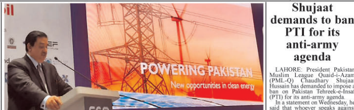
BANGKOK: Federal Minister for Energy, Khurram Dastgir addressing the Future Energy Asia Conference 2023 organised by USAID.

analysis in the financial position and autonomy of SECP. It is felt that not an increase but a reversion" the official remarked and said that the amendments have been made after detailed deliberation with industry stake holders including MUFAP. It was also charged that SECP is also levying annual fee investment funds whereas in other jurisdictions multiple fee including approval of funds, registration of fund, annual fees, filing fees are also imposed. The committee while taking briefing on the crypto currency debated that may be some momentary speculative gains be associated with crypto currency trading but there are no substantial National-level entities. The SBP official said that keeping in view number of frauds reported through crypto currency including USD 2 billion fraud in Turkey by an exchange named Hodex, and losses of 650 billion dollars in Turkey. The second largest crypto exchange bankruptcy in November 2022 INP.