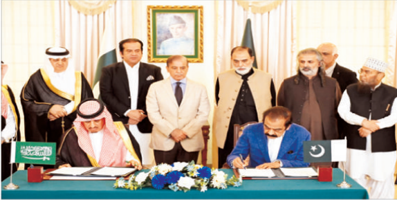
ISLAMABAD: Prime Minister Muhammad Shehbaz Sharif witnessing the signing ceremony of Memorandum of Understanding between Saudi Arabia and Pakistan "Road to Makkah Project" aimed at facilitating Pakistani Hajj.