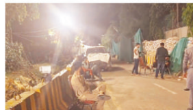
no action would be taken at Khan's Zaman Park residence before that, the information said, after the PTI chief expressed fears that he would be arrested. “Probably my last tweet before my next arrest. Police has [sic]

LAHORE: Punjab caretaker Information Minister Amir Mir said Wednesday night that the provincial government has no plans so far of arresting Pakistan Tehreek-e-Insaf (PTI) Chairman Imran Khan. “First let the 24-hour deadline expire then the government will reveal its plans,” the provincial minister said during an interview on Geo News' programme “Aaj Shahezab Khanzada Kay Saath”. The deadline expires at 2pm on Thursday and