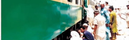
SUKKUR: Railway staffer's buys in repairing and back to train on track after a bogie of Shalimar Express derailed from the tracks near Rohri Railway Station in the Sindh province.

Research has shown that short-term exposure to cold activates brown fat and new brown fat research in humans investigates the potential influence of the body's own clock, its circadian rhythm, on the activation of the tissue. It finds, for men at least, that exposure to cold in the morning is more effective at activating brown fat production, or "thermogenesis," than any other time of day.