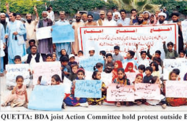
QUETTA: BDA joint Action Committee hold protest outside Balochistan Assembly.