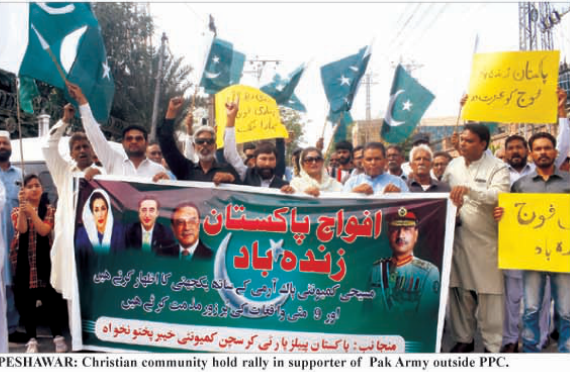
PESHAWAR: Christian community hold rally in supporter of Pak Army outside PPC.

The G7 leaders are keen on protecting cutting-edge technologies from their countries, ensuring that these innovations don't enhance others' military capabilities that "threaten global peace and security." While not stated outright, this refers to efforts by Beijing, other G7 allies and possibly Tehran and Pyongyang, to procure advanced equipment or expertise for military advancement. The goal is to limit the flow of "capital, expertise, and knowledge" from G7 companies to these countries. Surprisingly, Japanese Prime Minister Fumio Kishida, being the host, disclosed the main agenda of the Hiroshima Summit in a pre-summit article published on May 19. He highlighted two perspectives in the article: Upholding the "rules-based international order" and enhancing the G7's outreach to the "Global South." These priorities are strategically designed to address the Ukraine conflict and the challenge of a rising China. The two pressing issues confronting the US and its allies. Despite the significant amount of discussion surrounding the Ukraine conflict and its repercussions, the G7 leadership was primarily focused on the Indo-Pacific region and the gradual consolidation of the rival BRICS club - with China being a common factor in both areas of concern.