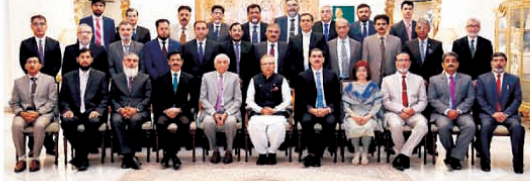
ISLAMABAD: President Dr Arif Alvi in a group photo with the participants of the Senior Officers' Leadership Course (SOLC-10), who called on him, at Aiwan-e-Sadr.

He said the Election Commission of Pakistan (ECP) was not holding elections because of the funds issue as the country was already facing an economic crisis. Pakistan could not afford separate elections rather simultaneous polls on one day across the country were the only solution, he added.