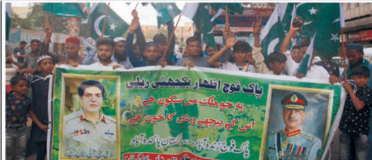
KARACHI: Activists of Azmi-e-Nujawan-e-Pakistan holds rally in the favor of Pak Army outside press club in Provincial Capital.