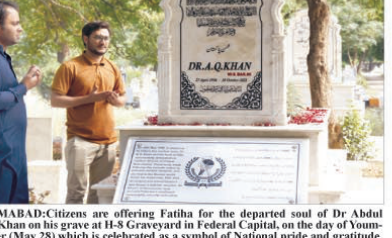
ISLAMABAD: Citizens are offering Faitha for the departed soul of Dr. Abdul Qader Khan on his grave at H-8 Graveyard in Federal Capital, on the day of Youm-e-Takbeer (May 28) which is celebrated as a symbol of National pride and gratitude.

RAWALPINDI: A horrifying incident unfolded on Sunday in Rawalpindi's People's Colony area as a gas cylinder explosion tore through a two-story house, resulting in the death of at least one person. The blast left a portion of the property partially collapsed, trapping eight individuals, including women and children. Meanwhile, rescuers and locals launched rescue efforts, pulled the injured out of debris, and shifted them to local hospitals. A spokesperson for the rescue operation confirmed that the blast occurred as a result INP