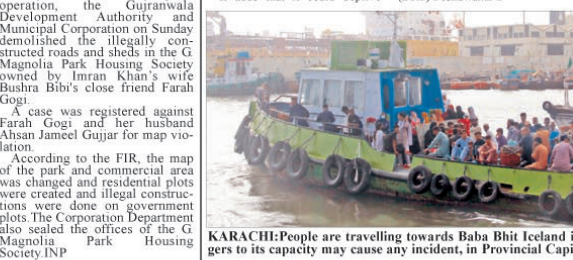
KARACHI: People are travelling towards Baba Bhti Iceland in boats as extra passengers to its capacity may cause any incident, in Provincial Capital.

MOSCOW: President Vladimir Putin ordered stronger border security to ensure "fast" Russian military and civilian evacuation from Ukrainian regions now under Moscow control. Speaking in a congratulatory message to the border service, a branch of Russia's Federal Security Service (FSB) on their Border Guard Day holiday, Putin said their task was to "reliably cover" the lines in the vicinity of the combat zone. Attacks inside Russia have been growing since damaged power lines, chiefly with drone strikes on regions along the border but increasingly also deep into the country, including on an oil pipeline north of Moscow, on Saturday. "It is necessary to ensure the fast movement of both military and civilian supplies and cargo, including food, humanitarian aid building materials sent to the new subjects of the Russian Federation," Putin said in a message posted on the Kremlin's Telegram messaging channel. Kherson, Zaporizhzhia, Luhansk and Donetsk are