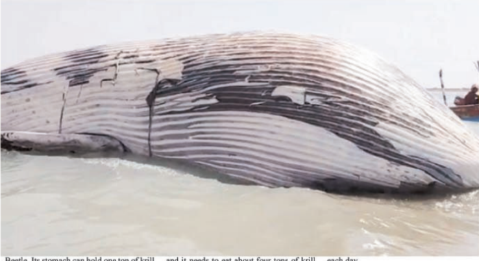
Beetle. Its stomach can hold one ton of krill and it needs to eat about four tons of krill each day.

The blue whale is the largest animal on the planet, weighing as much as 200 tons (approximately 33 elephants). The blue whale has a heart the size of a Volkswagen