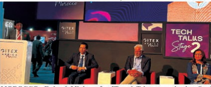
MOROCCO: Federal Minister for IT and Telecommunication Syed Amin Ul Haque addressing GITEX Africa Digital Summit in Morocco.

KARACHI - The Sindh government on Friday informed the Election Commission of Pakistan (ECP) that the mayor of Karachi will be elected through a show of hands.