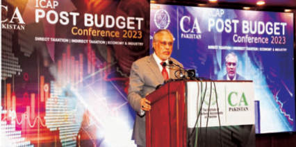
ISLAMABAD: Minister of Finance of Pakistan Muhammad Ishaq Dar addressing during the "Post Budget Conference 2023-24" in Federal Capital.

LAHORE: Former president and Pakistan People's Party (PPP) Co-chairman Asif Ali Zardari left for Dubai for an eye examination on Monday. Asif Zardari will return to Pakistan in a couple of days after meeting the doctor for eye check-up, informed sources have said. In his place, Foreign Minister and PPP Chairman Bilawal Bhutto Zardari will hold meetings with the party leaders and workers in Lahore. INP