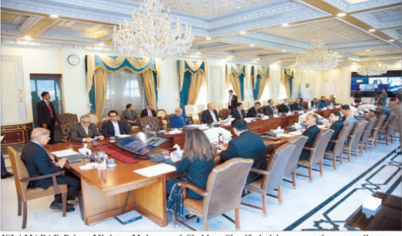
ISLAMABAD: Prime Minister Muhammad Shehbaz Sharif chairing a meeting regarding preparedness and measures taken for the approaching "Biparjio" Cyclone.

PM Shehbaz Sharif said the farmers and the youth of the country would become prosperous by availing the agriculture and business loans offered by the government in the budget 2023-24