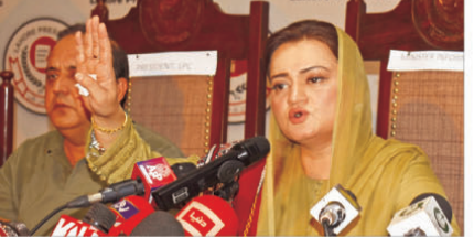
LAHORE: Federal Minister for Information and Broadcasting Mariyum Aurangzeb addressing press conference at Press club in Provincial Capital.

The Corps Commander Karachi was briefed by the authorities on the precautionary arrangements INP