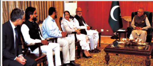
ISLAMABAD: President Dr. Arif Alvi in a meeting with a delegation from Artificial Intelligence Education Foundation (AIEF), at Aitwan-e-Sadr.