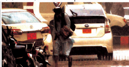
QUETTA: A man run during rain in provincial capital.

Detailing the firing incident, the senior lawyer said he remained safe in the attack while his driver sustained bullet wounds.