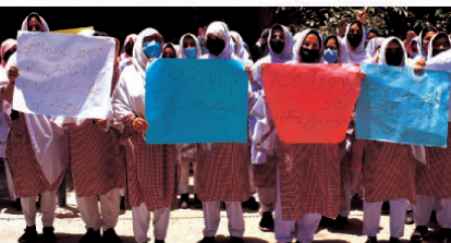
QUETTA: Activists of Young Nurses Association Balochistan hold protest outside OPC.

"We firmly believe that empowering women is crucial for a progressive and inclusive society," he said. "Through the digital lab and vocational initiatives, we aim to equip women with the necessary skills to excel in the digital era, opening doors to better opportunities and a brighter future," he added.