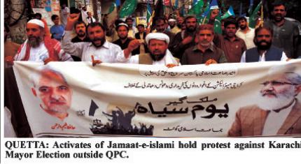
QUETTA: Activates of Jamaat-e-Islami hold protest against Karachi Mayor Election outside OPC.

complete siege and hapless Kashmiris who were virtually caged in their houses reeled under curfews and clampdowns for more than 14 months. Essential fundamental freedoms were suspended and the social, political and economic life of the region was virtually suppressed, the letter further said.