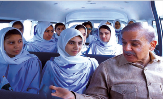
ISLAMABAD: Prime Minister Shehbaz Sharif interacts with Pakistan Sweet Homes Children's orphanage.

ered a detailed presentation, highlighting the steps taken to address the issue. He informed the committee that the department has been actively combating illegal activities and commercialization. However, due to a Supreme Court order issued on 5th January 2022, the ML&C has been restrained from taking action against school premises. The DG ML&C assured the committee that once the Cantonment Board (Amendment) Act 2023 is passed by the Parliament, stringent measures, including heavy fines and property sealing, will be implemented to ensure compliance with the directions. Senator Mushahid Hussain Sayed assured the petitioner that he would expedite the process in the Senate, aiming for the prompt enactment of the act to resolve the long-standing concerns of the residents. Following a comprehensive discussion, the chair disposed of the matter by endorsing the petitioner's request. The Committee was also briefed on counter-terrorist operations conducted by the Pakistan Army in Balochistan and Khyber Pakhtunkhwa, as well as the security situation on the borders with Iran and Afghanistan. Senator Mushahid Hussain Sayed commended the recent meeting between the Pakistan Prime Minister and the President of Iran on the Pak-Iran border, considering it a positive step forward in strengthening ties between the two nations. INP