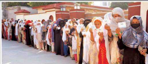
ISLAMABAD: Deserving People are stand in queue to take free food from the Sheikh Mohammed bin Rashid Al Maktoum Foundation, at Tarnol area in Federal Capital.

He said Pakistan continues to host one of the largest refugee populations in the world as the Security and Exchange Commission of Pakistan (SECP) and the Government of Pakistan opened their arms to develop a resilient market solely on the principles of humanity and solidarity and extended support despite the challenges posed by meager resources. He said that Pakistan's unparalleled humanitarian efforts in providing refuge to such a large number of displaced individuals, despite limited resources, have earned Pakistan its spirit.