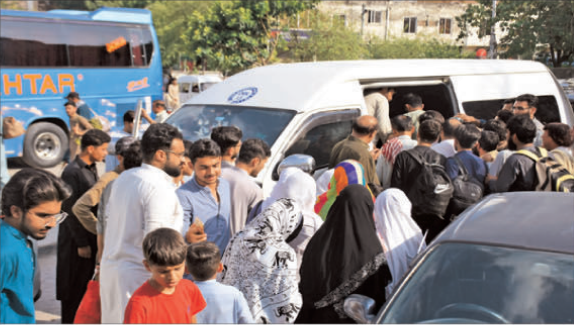
ISLAMABAD: A view of the hustle and bustle of passengers at Karachi Company Bus Stand as people are boarding into busses for leaving to their native villages for celebrating Eid-ul-Adha with great Zeal.

assemblies in August. Asif Ali Zardari and Bilawal Bhutto Zardari have been staying in Dubai for further talks with Nawaz Sharif and other PML-N leaders. The leaders of the two parties are likely to sit again today to resolve differences. The PML-N and the PPP have agreed to resolve the issues between them with dialogue. PML-N top leader Nawaz Sharif and PPP leaders Asif Ali Zardari and Bilawal Bhutto have been in Dubai for talks over the election and other political issues. "Former president Asif Ali Zardari discussed the charter of economy with PML-N leaders," sources said. The two sides also discussed the caretaker setup and future line of action in the meeting yesterday. The PPP leaders also clarified the party's stance over general election adding that they want election in October or November, according to sources.