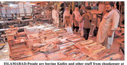
ISLAMABAD: People are buying Knives and other stuff from shopkeeper at Aabpara Market ahead of Eid-ul-Adha, in Federal Capital.

of animals to follow the Sunnah of Hazrat Ibrahim (AS). Federal and Provincial governments have chalked out an elaborate security arrangement across the country to ward off unlawful incidents. Civic authorities of different cities and towns have also made special arrangements for disposal of offal and other solid wastes during the Eid days. Radio Pakistan, Pakistan Television and private media will air special programs in connection with Eid-ul-Azha while newspapers will publish special supplements highlighting the importance of Eid-ul-Azha and sacrifice of the animals.