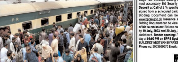
KARACHI: A view of the hustle and bustle of passengers at Cantt Railway Station as people are boarding into train for leaving to their native villages for celebrating Eid-ul-Adha with great Zeal.

MECCA: Around three million pilgrims from across the globe are converging at Mount Arafat, the Jabal ar-Rahmah on the second day of the pilgrimage to perform the major Hajj ritual. Countless pilgrims are making their way from Mina to the plains of Arafat, utilizing buses and trains as their mode of transportation. Train tickets have been allocated to 63 percent of the pilgrims participating in the government scheme. This elevated hill holds great historical significance as it served as the location where Prophet Hazrat Muhammad (S.A.W) delivered his Farewell Sermon to the Muslims. Standing on the expansive plains of Arafat, this significant granite hill serves as a remarkable symbol of that crucial moment in Islamic history. Pilgrims devote the entire day at Arafat to supplicating to Allah, seeking forgiveness for their sins, and praying for personal strength in the future. Pilgrims then their way to Masjid Nimrah on the grounds of Arafat, where they will listen to the Arafat sermon amid continuous chanting of 'Labbaik Allahuma Labbaik' INP.