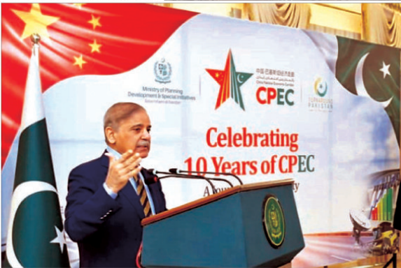
Prime Minister Muhammad Shehbaz Sharif addressing a ceremony commemorating the 10th anniversary of signing of the agreement for CPEC.