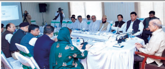
KHYBER PAKHTUNKHWA: Prime Minister Muhammad Shehbaz Sharif chairs a meeting before the groundbreaking ceremony of mega development projects for Torgarh and Buner districts, Torgarh.

Chinese officials from PMLTC are expected to visit Mehran Paradise and announce further support for improving facilities at this popular recreational spot. As a token of appreciation for their support, the Civil Society presented a Shikhar, a Pakistani official from PMLTC. The China-made F-7 fighter jet, a symbol of China-Pakistan defence cooperation, have long served in the Pakistan Air Force.