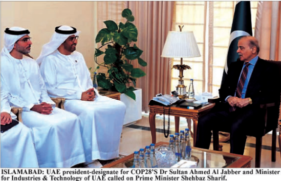
ISLAMABAD: UAE prime-designate for COP28's Dr Sultan Ahmed Al Jaber and Minister for Industries & Technology of UAE called on Prime Minister Shehbaz Sharif.

The forces with a negative mentality were trying to spoil the peace of the world through such incidents, he added. Incidents of insulting not only the Holy Quran but also other religions were happening in other secular countries, including Sweden, he pointed out. He said that if Swedish people by allowing such anti-peace elements showed that they were uncivilized. In response to a question, Bishop Khalid Rehmat urged the United Nations, the European Union and the world to play their role in punishing the accused. He demanded for enacting the international laws to prevent such incidents in the future. "Desecration of Holy Quran is an unforgivable and heinous crime. Sweden must apologise to the Muslims for the incident," said Bishop Khalid Rehmat while addressing a press conference here. Pastor Simon Bashir, Father Inayat Gill accompanied the bishop. He said that the desecration of the Holy Quran in Sweden was unacceptable and blasphemous act in the name of freedom of expression. INP