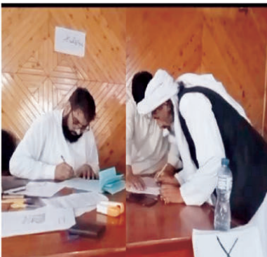
chairmen seats in Khuzdar, Sobhat Pur, Sorab, Jaffarabad, Kech districts of Balochistan.

Balochistan National Party (BNP) has won Noshki, Gwadar, Kharan districts. However, National Party (NP) has won Panigur, Kalat and Mastung with the support of political allies. In Chaghi, the Pakistan Peoples Party (PPP) has won. The party has also won chairmen and deputy