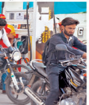
KARACHI: Bikers line up at Petrol Pump to refill tanks of their bikes as for implementation of mandatory helmet. Administration order to Fuel station to make the helmet mandatory for refueling, in City.