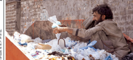
RAWALPINDI: gypsy man is searching valuables from a garbage dump along Rawal road to sell and earn daily wages for the livelihood of his family.

GUJRANWALA: An oil refinery unit at Alipur Chhattha has caught fire and a firefighting operation has been underway, sources said on Sunday.