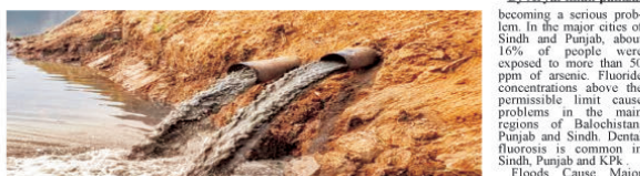
Take defensive measures and treatment technologies to overcome hygienic condition of drinking water inventories in different areas of Pakistan.

Anthropogenic conditioning beget waterborne conditions that constitute about 80% of all conditions and are responsible for 33% of deaths. This review highlights the drinking water quality, impurity sources, sanitation situation, and goods of unsafe drinking water on humans. There's immediate need to