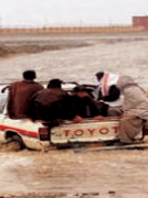
Impact of flood and drought in the province.

Pakistan is particularly vulnerable to natural disasters including floods. The 2010-11 floods adversely affected the economy of Pakistan. The geographical location of Balochistan is prone to many natural disasters, like droughts, floods, and earthquakes. The recent monsoon spells have adversely affected the rural communities of Balochistan. Dam and reservoirs can minimize the initial pressure of flood on one