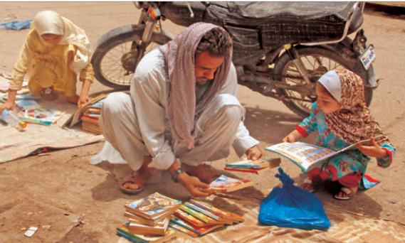
KARACHI: People are taking interest in the books on stalls along the road side at Sadr area as in these modern days people who likes books are very rare in Provincial Capital.