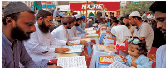
HYDERABAD: Workers of Tehreek-e-Labak Pakistan (TLP) Reciting the Holy Quran to record their protest at Hyder Chowk against burning the copy of Holy Quran in Sweden.

which jumped to 6.64 billion Euros in 2021. However, Pakistan's imports have also increased by 69 percent during the period.