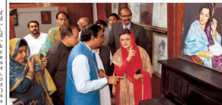
LAHORE: Federal minister of Information and Broadcasting Maryam Aurangzeb taking keen interest in the portraits of Pakistan favorites classical singers during her visits of Radio Pakistan in Provincial.

It represents the rate of exploitation, said the former countries director, inflation soaring, people losing jobs and their families facing starvation. This is the bleak picture painted by the Western media.