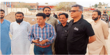
and Quetta Green Bus Service Parking projects under the Quetta Development Package and reviewed the progress of the construction work on the development projects.

The Chief Secretary made a detailed visit to the Inlaks Road, Spiny Road, Sariab Road, Radio Pakistan Road, Link Badim Road, and