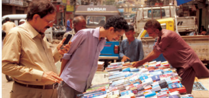
KARACHI: People are taking interest in the books on stalls along the road side at Sadr area as in these modern days people who likes books are very rare in Provincial Capital.

916 more than 2022-23. On the other hand, accidents caused 720 hours delay, bad weather caused 6079 hours delay which was 4163 hour more than previous financial year.