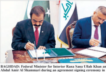
BAGHDAD: Federal Minister for Interior Rana Sana Ullah Khan and Interior Minister of Iraq Abdul Amir Al Shammari during an agreement signing ceremony in Baghdad.

PESHAWAR: In a significant stride towards strengthening emergency medical services and fortifying disaster relief capabilities, the World Health Organization (WHO) has generously contributed 15 motorbike ambulances and two vehicle ambulances to the Relief Department Khyber Pakhtunkhwa. This benevolent donation marks a remarkable milestone in advancing healthcare accessibility and rapid response within the province. The official handover ceremony took place on Tuesday at the Rescue 1122 headquarters in Peshawar, uniting distinguished representatives from WHO, the Relief Department, and the Health Department to mark this momentous occasion. The event underscored the spirit of collaboration and unwavering dedication to safeguarding public health and providing swift assistance during crises. Motorbike ambulances have emerged as invaluable assets for delivering critical medical aid, particularly in areas with challenging terrains or limited accessibility. These agile and well-equipped vehicles will empower Rescue 1122 first responders to navigate rugged landscapes and swiftly reach remote communities, drastically reducing response times in life-threatening situations. Equipped with essential medical tools such as a backpack. INP