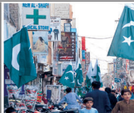
QUETTA: A view of national flag install on bazaar for selling purpose on ahead of 76th Pakistan Independence Day (1947).