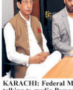
KARACHI: Federal Minister for Energy Engineer Khurram Dastagir, talking to media Persons after meeting with the officials of K. Electric.

LAHORE: The Pakistan Tehreek-e-Insaf (PTI) over violation of party policy on Wednesday, expelled its 13 leaders including Raja Riaz and Noor Alam Khan.