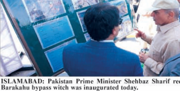
ISLAMABAD: Pakistan Prime Minister Shehbaz Sharif received briefing regarding Barakahu bypass which was inaugurated today.

His father also suffered jail hardships, he added INP.