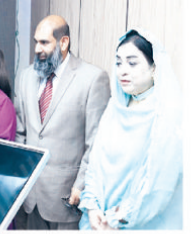
ISLAMABAD: Prime Minister Shehbaz Sharif launching Prime Minister Digital Youth Hub.