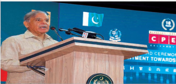
ISLAMABAD: Prime Minister Muhammad Shehbaz Sharif addressing a ceremony organized to honour the contribution of Chinese's companies operating in Pakistan under the CPCEC.

The session ended with the distribution of Certificates to the participants.