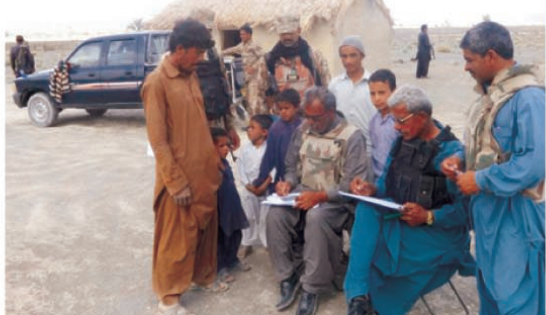
(BNP) said in a statement and urged Islamabad not to miss the province's genuine population.