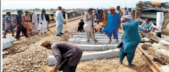
HYDERABAD: Railway workers busy in repairing railway track next to derailed train.

Such initiatives will stop the flight of capital and brain drain, he said, adding that it is necessary to restore the confidence of the business community and people in the economic policies and the current economic situation of the country.