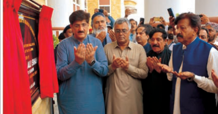
THATTA: CM Sindh Murad Ali Shah inauguration of International Medical and Technical College LUMHS.

ISLAMABAD: The Government of Pakistan has directed Pakistan Council of Research in Water Resources (PCRWR) for quarterly monitoring of bottled mineral water brands and to publicize the results for awareness.