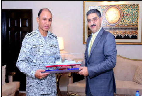
KARACHI: Chief of Naval Staff Admiral Muhammad Anjad Khan Nazki presenting a model of Tughril Class frigate 'PNS Shah Jehan' to Caretaker Prime Minister Anwaar-ul-Haq Kakar.

ATTOCK, Aug 30 (INP): The special court set up to hear cases under the Official Secrets Act extended PTI Chairman Imran Khan's judicial remand in the cipher case by 14 days. The hearing of the cipher case involving the Pakistan Tehreek-e-Insaf (PTI) chairman was held at the Attock Jail following an official approval from the Ministry of Law.