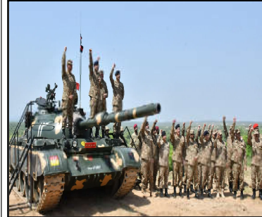
Staff (COAS) visited Tilla Field Firing Ranges near Jehlum today. COAS witnessed Field Fire and Battle Drills.

COAS praised the troops for their combat proficiency and offensive spirit.