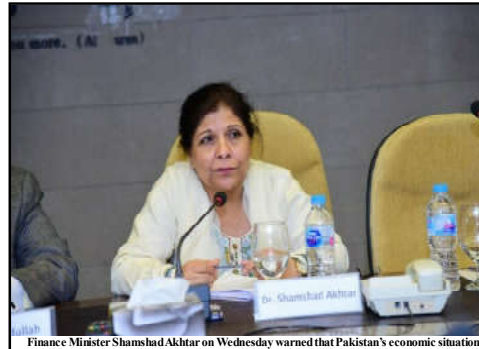
Finance Minister Shamsah Akhtar on Wednesday warned that Pakistan's economic situation.

Akhtar added that the proposal to withdraw facilities for the privileged class was under consideration and a briefing would be given to the committee on the economy after a week. Prior to the finance minister's briefing, a number of committee members raised concerns regarding rising dollar and sky-high electricity bills. PPP Senator Sherry Rehman highlighted that there was a long list of taxes in power bills. News Desk.