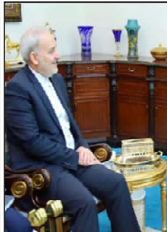
ISLAMABAD: Ambassador of Iran to Pakistan Dr. Reza Amiri Moghaddam called on Caretaker Prime Minister Anwarul Haq Kakar.