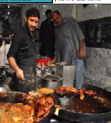
PESHAWAR: A man busy in frying fish for customers at Qassa-Khwani market.