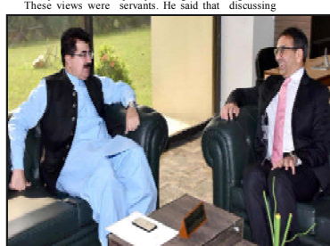
ISLAMABAD: Caretaker Minister for Energy, Power Muhammad Ali Chaudhry on Chairman Sadiq Sanjrani.

Sutlej River has been in medium flood at Bahawalnagar district and 86 settlements of the river belt have been affected in flood. Ferocious flow of the river water has swept away protective dykes and roads in the district. The land link with over 100 settlements has been disrupted and standing crops of thousands of acres have drowned while the water has flooded several houses. Floodwater has developed craters at link roads connecting river belt with the main highway. Rescue teams have shifted 12,236 people stranded in flood water to safer places. The administration has set up 30 flood relief camps for affected people.