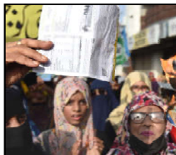
KARACHI: Activates of Jamaat-e-Islami Women wing burn electricity bill during protest against over electricity bill charges.