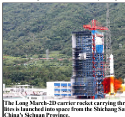
The Long March-2D carrier rocket carrying three remote sensing satellites is launched into space from the Shichang Satellite Launch Center in China's Sichuan Province.