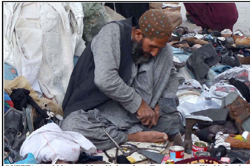
QUETTA: A cobbler repairing old shoes for selling purpose at Weekly Sunday Bazaar at Joint Road.