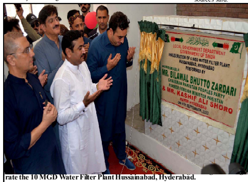
rate the 10 MGD Water Filter Plant Hussainabad, Hyderabad.

ISLAMABAD (INP): There are chances of improvement in the financial condition of the Pakistan International Airlines (PIA) as the government's intervention, private banks have decided to start giving loans to the airline again. As per instructions given to banks, funds will be released to the PIA, which is grappling with financial constraints because of the inability to repay interest let alone the principal amount. It is being hoped that the release of funds, which is expected to start next week, will help better the balance of payment by the national flag carrier. The airline's management has decided to spend the amount on the purchase of spare parts for planes and other purposes. The three days ago, Caretaker Prime Minister Anwaar-ul-Haq Kakar had called for drawing up a detailed plan for the restructuring of struggling flag carrier as soon as possible.