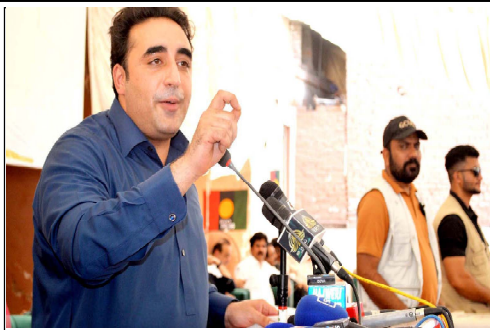
HYDERABAD: Chairman Pakistan Peoples Party addressing to inauguration ceremony of 10 MGD Water Filter Plant Hussainabad, Hyderabad.

The law ministry has sought 15 days' time from the court for submission of additional documents. The Office granted the plea, sources said.