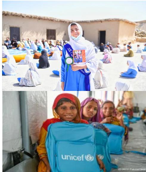
Girls students at TLC established in Naserabad: Photo provided by UNICEF

The province has not conducted any survey to assess the learning quality of students studying in over 15,000 government-run primary, middle and high schools across Balochistan. As per a confidential report obtained by Daily Quetta Voice, still over 2 million children are out of school. Similarly, the number of enrolled students in government schools is 1,119,925, the report mentioned. The students studying in private schools are in addition to this. However, no data about the private schools' enrollment is available.