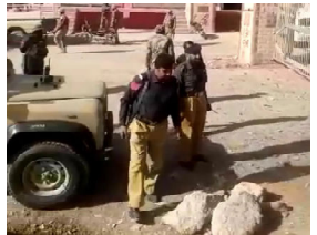
Chief Minister's Secretariat said. The CM directed the local administration to form a joint team of levies and police to recover the kidnapped football players.