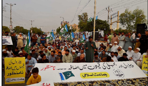
KARACHI: Activists of Jamat-e-Islami hold a protest against the rise in Petrol Prices.