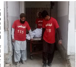
Police sources said the incident seems to be an act of targeted killing in the provincial capital.

The assailants sped away on their motorcycle after the attack. The dead body of the CTD personnel was shifted to civil hospital Quetta. Senior police and other law enforcement agencies personnel reached the spot and started an investigation into the incident.