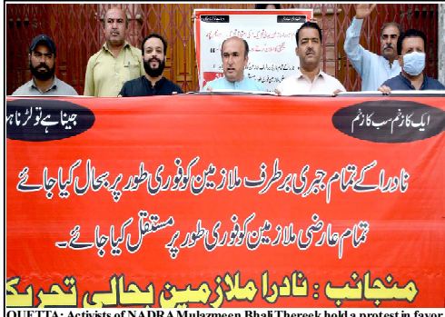
QUETTA: Activists of NADRA Mulazmeen Bhai Thereek hold a protest in favor of their demands in front of the press club.

treatment practices across the world. The Institute is the only public sector cancer care hospital in Pakistan that is equipped with the most advanced treatment facilities including Cyberknife and True Beam Linear Accelerator and is providing state-of-the-art treatment that meets the International Standards. The hospital treats and manages all types of cancers, irrespective of the stage. Participants from all over the country will also join the event. The event would cover various aspects of palliative radiotherapy for brain metastases and locally advanced head and neck cancers including different practices across the world, radiotherapy treatment protocols, types of machines and facilities available, contouring and planning techniques used, case discussions and expert opinions. The practical aspects of this educational activity include hands-on training sessions on contouring, treatment planning, dosimetry and quality assurance. The regional training course will continue for four days.