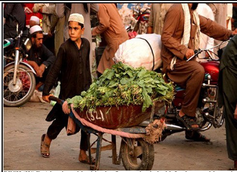
PESHAWAR: A boy is pushing his wheelbarrow loaded with fresh vegetables at the vegetable market.

LAHORE (INP): Punjab Caretaker Chief Minister Mohsin Naqvi left for China along with a high-level delegation on a five-day official visit on Sunday. The acting Chinese consul general saw the Punjab chief minister off at Lahore Airport. He expressed good wishes for the chief minister regarding his visit to China. 'It is hoped that your visit to China will be crucial for the promotion of mutual cooperation,' the acting Chinese consul general said. Provincial ministers and officers concerned were also present on the occasion. The chief minister will meet the businessmen, investors and industrialists during his visit to China. He will also hold meetings with Chinese authorities to increase cooperation in Agriculture, IT and technology sectors.