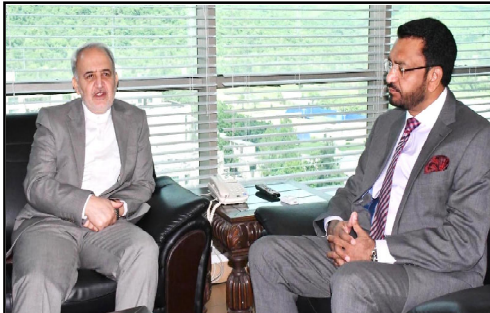
ISLAMABAD: Iranian Ambassador to Pakistan Reza Amir Moghadam called on Caretaker Federal Minister for Human Rights and Women Empowerment, Khalil George.