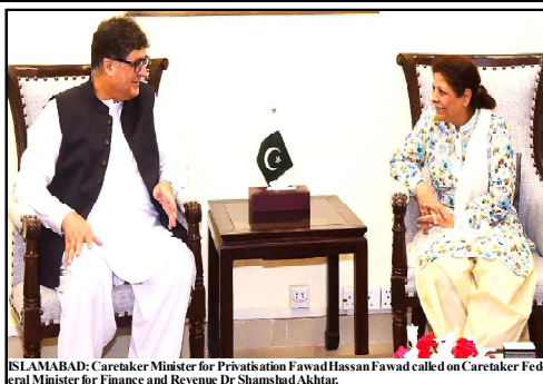
ISLAMABAD: Caretaker Minister for Privatization Fawad Hassan Fawad called on Caretaker Federal Minister for Finance and Revenue Dr Shamsah Akhtar.