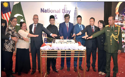
ISLAMABAD: Federal Commerce Minister Gohar Hjaz, High Commissioner of Malaysia Azhar Mazlan and others cutting cake to celebrate the 66th Independence Day of Malaysia at a local hotel.

Under the scholarship program of the Chinese Ambassadorial Program, every year 140 scholarships are disbursed to the needy and talented students of KIU main campus and its sub-campus. To address the issue of gender balance, a minimum of 50% of the beneficiaries are females.