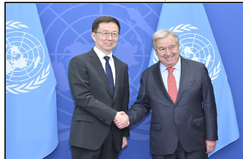
Chinese Vice President Han Zheng shakes hands with United Nations Secretary General Antonio Guterres on the sidelines of the ongoing 78th session of the United Nations General Assembly in New York.