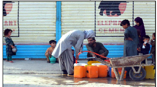
QUETTA: People busy in filling their water pots from drinking water point.

freezing cold last winter. A man aged 73 and a woman of 70 were killed in a separate air strike on the town of Beryslav in the southern Kherson region, officials said. The administrative head in the city of Kherson - the region's main center - later said that two city residents had died and two were injured in Russian shelling. Russian forces abandoned Kherson city and the west bank of the Dnipro River in Kherson region late last year, but regularly shell different areas from positions on the east bank.