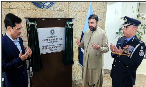
ISLAMABAD: Caretaker Interior Minister Sarfaraz Ahmed Bugti inaugurating the First Police Driving School for Women.

The minister was told that almost 24k students are enrolled in all of the FDE institutions.