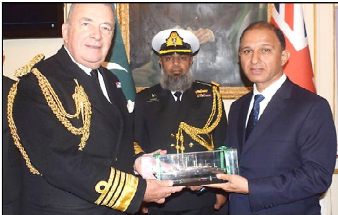
LONDON: Chief of the Naval Staff Admiral Muhammad Amjad Khan Niazi presenting souvenir to Former First Sea Lord and Chief of the Naval Staff Royal British Navy, Admiral Lord Alan West during Transfer Agreement Signing Ceremony for the ex-Pakistan Navy Ship TARIQ to UK.

"The caretaker government is committed to holding free and fair elections. The caretaker government will support the constitutional and legal structure for holding elections and would ensure that all orders and directions of the Election Commission of Pakistan and independent judiciary are complied with in letter and spirit," the government said in its statement.