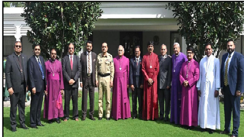
RAWALPINDI: Caretaker Federal Minister for Human Rights Khalid George along with 13 members' delegation of Christian Community called on General Syed Asim Munir NI (M), Chief of Army Staff (COAS) at General Headquarters.

According to a CTP spokesman, two main processions will be taken out and the first procession will start from Jamia Masjid Hanaifa Jamia Masjid Whereas, Traffic, from Liaquat Bagh to Fawara Chowk will be diverted from DAV College towards Gawalmandi. The second procession will be taken out at 9:30 AM from Cheng No. 22 which will start from Trench Road, Dhok Syedan Chowk, Kalna Chowk, No. 22 Chowk, Adam Road.