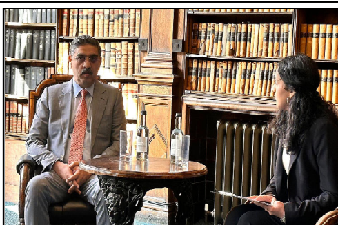
LONDON: Caretaker Prime Minister Anwaar-ul-Haq Kakar interact with students at O'Fjord Union in London.