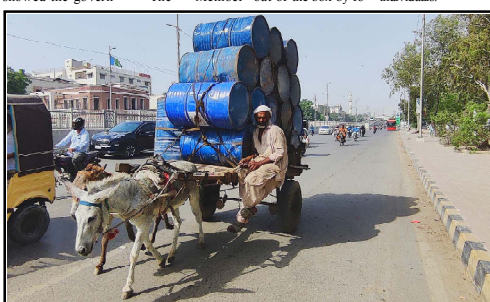
KARACHI: Donkey cart holder on the way loaded with steel drum going toward their destination in provincial capital.