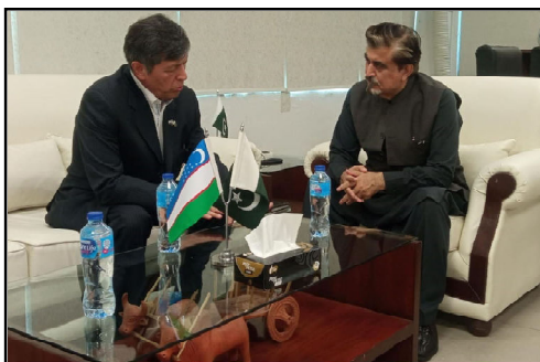
ISLAMABAD: Ambassador of the Republic of Uzbekistan to Pakistan Obyek Arif Usmanov called on Jamal Shah, Interim Federal Minister for National Heritage and Culture at his office.