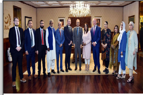
ISLAMABAD: President Dr Arif Alvi in group photo with a delegation of the members of the British Parliament and the representative of the Pakistani and Kashmiri diaspora in the UK at Aiwan-e-Sadr.