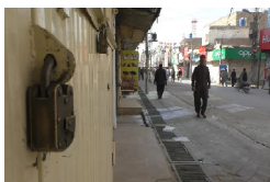
of law enforcement personnel, including police, levies, and frontier corps, in sensitive areas throughout Balochistan.

To maintain law and order during the strike, the provincial government implemented stringent security measures. This included the deployment