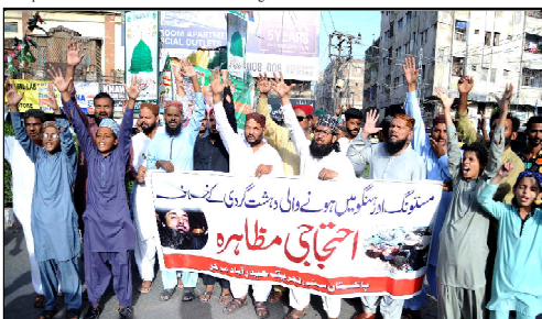
HYDERABAD: Workers of Sunni Tehreek Pakistan hold a protest rally against terrorists, who were involved in the Mastung bomb blast.