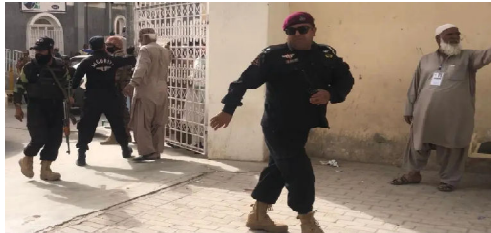
Security personnel walk inside civil hospital Quetta after the arrival of injured of Mastung blast: Photo Daily Quetta Voice

The Information Minister announced a compensation of Rs.1.5 million each for the heirs of the