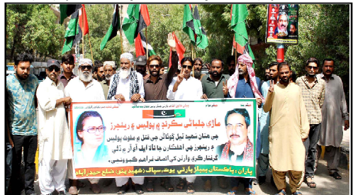
HYDERABAD: Workers of Pakistan Peoples Party (SB) hold a protest against the Sakrand incident, in Hyderabad.

Q3 2023. The report noted that there was a consistent and alarming increase in violence in Khyber Pakhtunkhwa and Balochistan. Equally greater concern is the collective percentage of violence-related fatalities recorded in these two provinces which indicates a disturbing upward trend over the last five years; together, they suffered 72% of all fatalities in 2019, and this unsettling figure surged to a staggering 92% in the first 9 months of 2023.