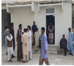
for help echoing in the chaos," he said, his words carrying the weight of the immense suffering he

"The injured were covered in blood, their cries