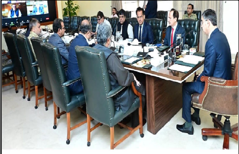
ISLAMABAD: Caretaker Prime Minister Anwaar-ul-Haq Kakar chairs a meet ing of the National Task Force for Eradication of Polio.