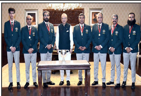
ISLAMABAD: President Dr Arif Alvi in a group photo with the Pakistan Long Range Field Target Rifle Team who won the European Long Range Rifle Championship 2023 held in Britain, at Awwan-e-Sadr.