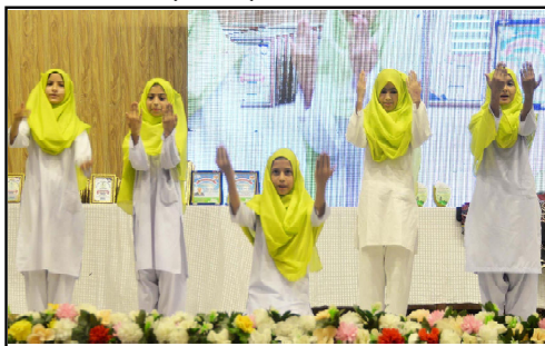
HYDERABAD: Students present a tableau during a ceremony "Salam Teacher" on the eve of World Teachers Day, organized by Government School Teachers Association.