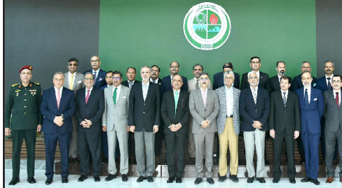
ISLAMABAD: Caretaker Prime Minister Anwaar-ul-Haq Kakar in a group photo after the inaugural ceremony of National Emergencies Operation Center established by NDMA.