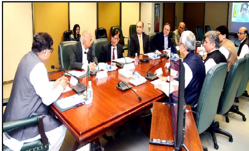
ISLAMABAD: Caretaker Federal Minister for Privatisation Fawad Hasan Fawad chaired a Privatisation Commission (PC) Board Meeting.

The oil, gas, and coal mafias reemerged in Pakistan in dozens of countries, but the governments took decisions according to the public interest, which brought relief to the people and reduced environmental pollution, he informed.