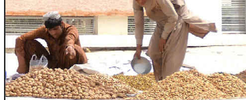
QUETTA: A vendor selling dry fruit at air port roadside.

One notable inclusion is a document authored by John Marshall, offering insights into the discovery of Mohenjo-daro and Harappa, two pivotal sites in the history of archaeology. The preservation of this historical treasure is of paramount importance. Specialized brushes, stone weights, gloves, and protective eyewear are being employed to ensure the documents remain intact through the cleaning process.