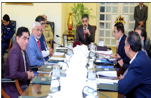
ISLAMABAD: Caretaker Prime Minister Anwaar-ul-Haq Kakar chairs a meeting regarding Pakistan International Airlines.

This time frame is a period of enormous change characterized by a high degree of plasticity in the child's neurological development. Investments in the early years of life are the foundation of human capital, and human capital is a key driver of economic development in the modern economy.