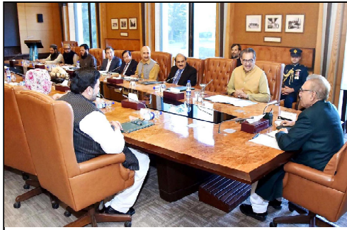
ISLAMABAD: President Dr. Arif Alvi chairing a meeting on the role of the mosques and the pulpits in social development, at Aiwan-e-Sadr.