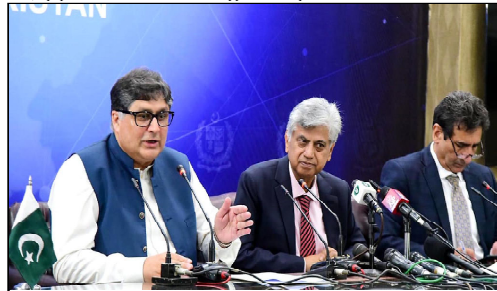
ISLAMABAD: Murtaza Solangi, Caretaker Federal Minister for Information & Broadcasting and Mr. Fawad Haseem Fawad, Caretaker Federal Minister for Privatization briefing the media on Federal Cabinet decisions.

The minister requested the educationists of both the private and public sectors to take steps for areas with lesser education facilities and lower literacy rates and children are facing difficulties in getting education.