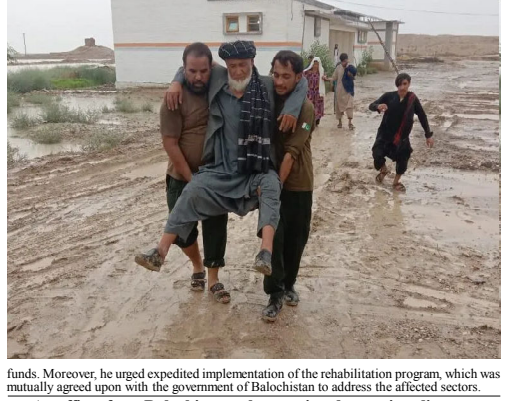
An officer from Balochistan to be appointed as project director

2.280 kilometers of road network de-stroyed 1.039 educational institutions were completely demolished, while 1,793 were partially affected Widespread damage to irrigation structures leading to crop losses Expressing his concerns, the caretaker Chief Minister of Balochistan pointed out that he allocated funds for the province from inter-national rehabilitation aid were insufficient in opmarison to the staggering losses. He em-phasized the need for an increase in funding requesting the federal government's support with a 20% grant sharing from the Geneva